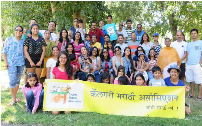
Group of campers congregate for a photo