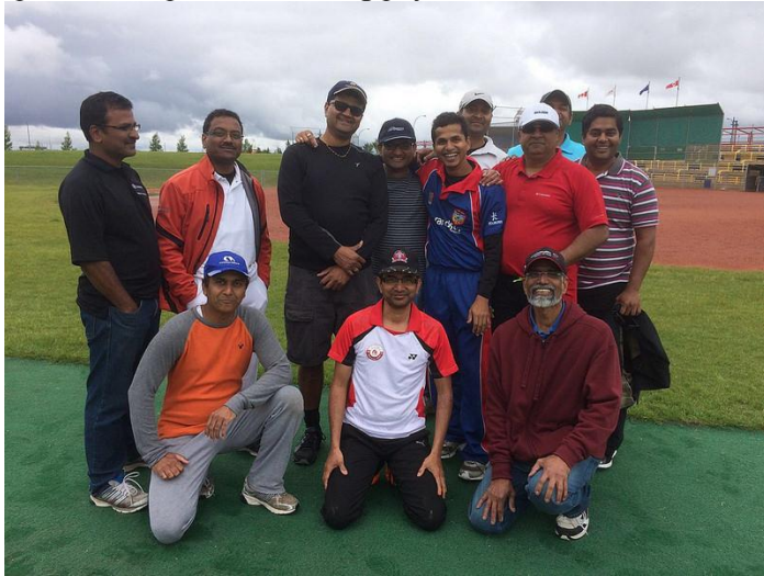
Cricket Enthusiasts collect at Rotary Park.

Rain washed out the picnic but not the spirit of cricket. North and South Calgary played against each other once again demonstrating the importance of teamwork, sportsmanship and maintaining physical fitness.