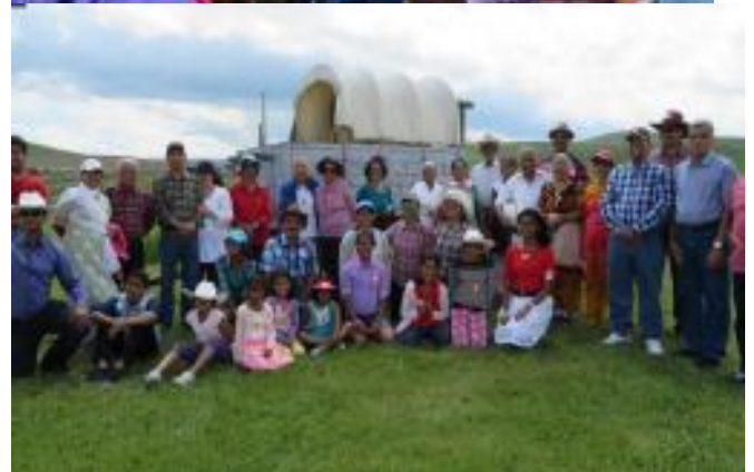
Seniors share the pride of Canada Day