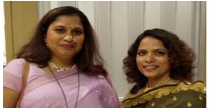
Women were greeted with traditional trinkets.