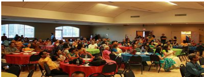
Children (next generation Canadians) showcase Marathi Culture through a colourful traditional dance performance.