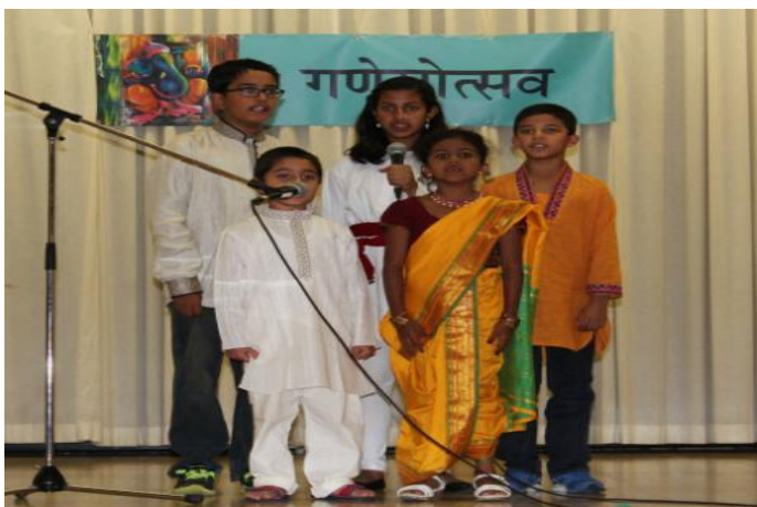
Marathi Language School Children performance