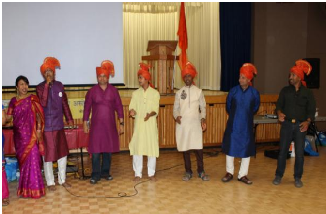
Current EC for 2016 and Future EC for 2017