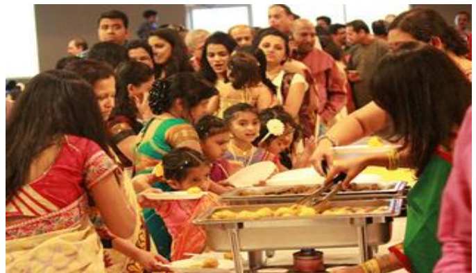
Traditional food is served to the community.

The evening was decorated with dazzling performances by little children and songs by groups followed by mixing and mingling along with group games and a traditional meal of Batata wada (Potato cakes) and Puran Poli (Stuffed sweet Indian style bread) – both considered delicacies in the culture. A large gathering enjoys Gudhi Padwa as depicted in the picture.