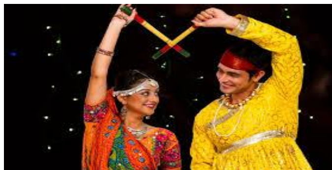
Couple enjoying Dandiya Raas